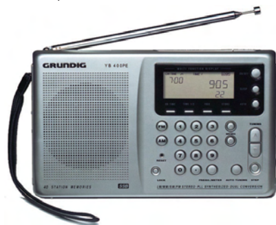
Grundig Yacht Boy is a popular SW radio

They also offer for download a very slick small software program for keeping your computer time accurate to the second (nistime-32bit.exe).