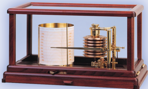
Admiral's Choice (Model 265 / 267)

Available worldwide www.fischerbarometers.com